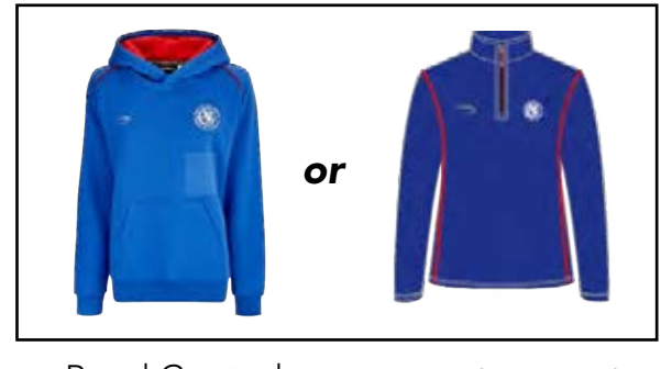
Royal Crested Hoodie Schoolblazer