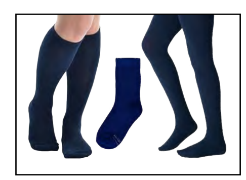
Winter Navy socks or tights