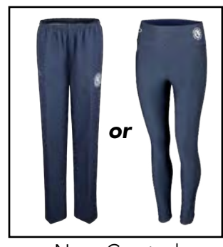
Navy Crested Training Pant or Fitness Leggings Schoolblazer