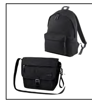
Closable School Bag