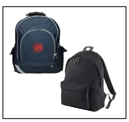
Rucksack Two Strap