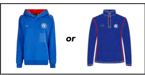
Royal Crested Hoodie or Midlayer Schoolblazer