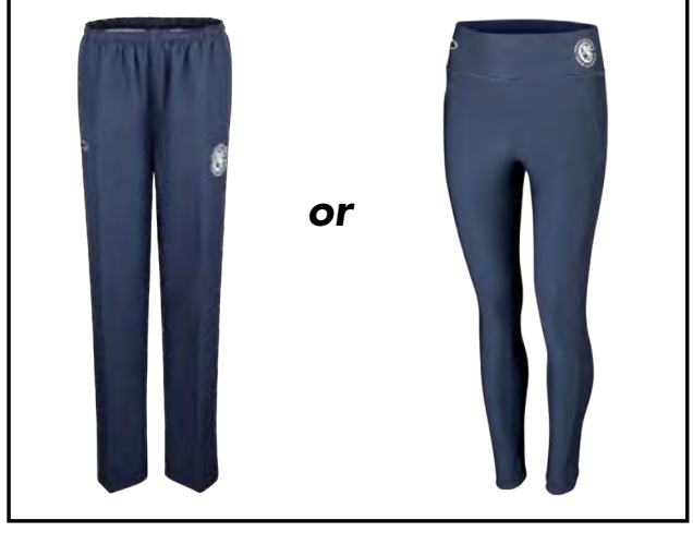
Navy Crested Training Pant Schoolblazer