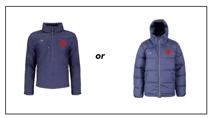
Navy Crested Active Jacket Schoolblazer

These are COMPULSORY items required to represent the school in sport fixtures.