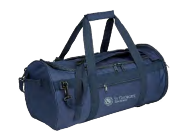
Navy Crested Duffle Schoolblazer