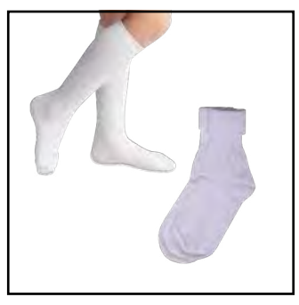
Summer White Socks (No trainer liners)