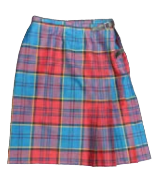
St George's Kilt Kinloch Anderson- Order through St G's