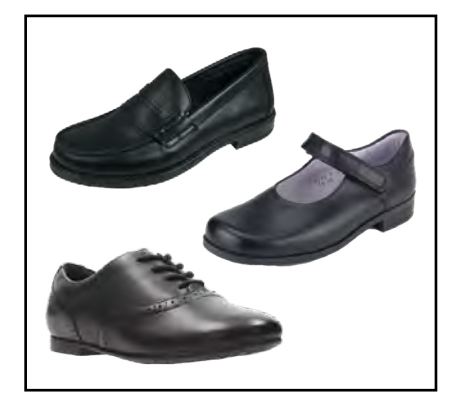
Black or Navy Leather Shoes (Supportive structured style with flat or low heels. Plain soles.)