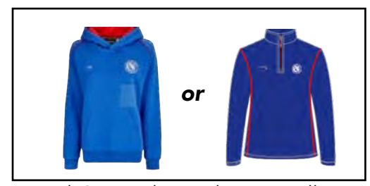
Royal Crested Hoodie or Midlayer Schoolblazer