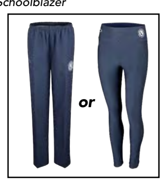
Navy Crested Training Pant or Fitness Leggings Schoolblazer