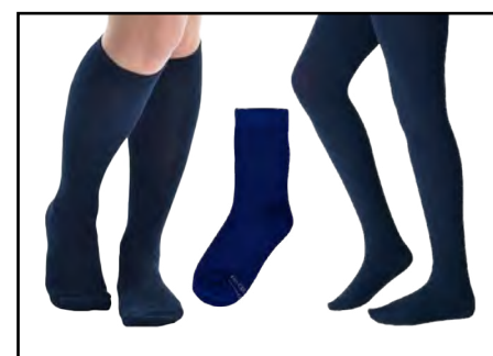
Winter Navy socks or tights

(Supportive structured style with flat or low heels. Plain