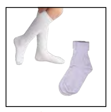
Summer White Socks (No trainer liners)